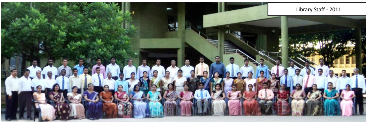
Library Staff - 2011

I retired as Librarian in 2011 September and I am very happy to note that the Science library which occupied the old Physics building is moving into a fully equipped new building on 21 January 2021, when the University of Colombo is celebrating its 100 years of existence.